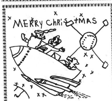
Drawn by VICKIE SIMPSON