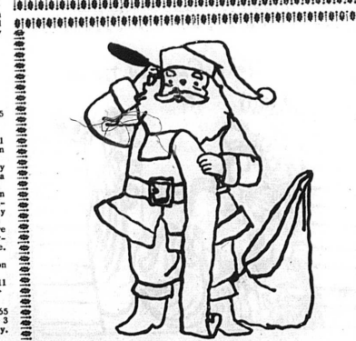
Compliments of Drawn by BRENDA BLAKE