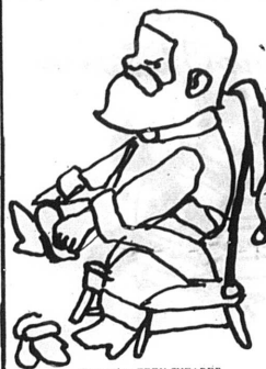
Drawn by EDDY SHEARER