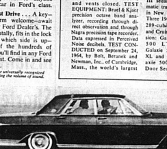
New 1965 Ford Galaxie 500 LTD being driven.

Quiet Means Quality . . . Since quiet is a traditional measure of car quality, Ford engineers designed the '65 Ford for maximum quietness. To illustrate