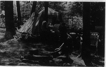
CAMPING IS A FAVORITE ACTIVITY

Kentucky's tourists come from every state in the nation and many foreign countries, with two-thirds of the total from Illinois, Tennessee, Indiana, Ohio, Michigan, Missouri, Texas, Virginia and Florida.