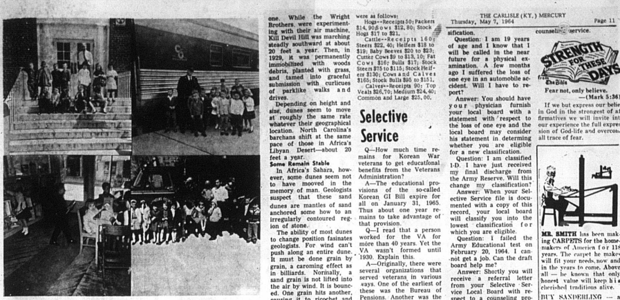
KINDERGARTEN NIGHT SEEING—Top picture, at left, Visiting the Carleise Post Office; at right, train ride from Lexington to Winchester on the George Washington; lower left, the Nichols County Library; lower right, inspecting the Nichols County fire truck.

SAND DUNES Lake areas invading from the sea, coastal dunes in Europe and the eastern United States have marched across nearby farms and woods. A small village on Germany's Baltic coast was slowly buried over 30 years, then just as quietly dismantled over the next 30-year span. But man has recently learned that coastal dunes have a definite purpose in nature's scheme—the protection of shorelines. Massachusetts law prohibits any tampering with dunes, and a massive dune rehabilitation job was undertaken by the National Park Service on North Carolina's Outer Banks in the 1930's. Ironically, the world's most famous dune — Kill Devil Hill—has ceased to exist. There are five general types: the beach dune; the dune ridge; the dune that forms at a right angle to the wind; the longitudinal sand dune that parallels the wind's direction; the U-shaped dune whose open end faces windward; and the baraban, the photographically ideal lunars crescent whose horns point downwind. Most beach dunes are quartz sand. Those in Great Sands National Monument are gritty; the dunes in New Mexico's White Sands National Monument are the products of the world's largest known deposit of milkywhite powder-fine gypsum sand. In Bermuda, dunes of coral sand have cemented themselves into stone. Village Buried Under Dunes Dunes can be deadly