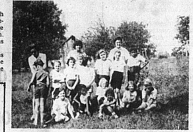
Brownies Get Their Wings

A—Yes. Women veterans are eligible for the same benefits and under the same conditions as men.