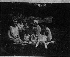
Brownies Gather Wood

A—The veteran or his physician applies for admission which is forthcoming if he is eligible, needs medical care and a bed is available. In service-connected cases, a bed is always available.) In the case of a sudden emergency, the veteran may be taken directly to the hospital but someone acting for the veteran