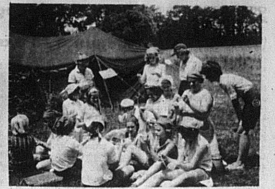
Cadettes Learn Knots

A—Yes. If he is otherwise qualified and can meet the credit requirements of the lender.