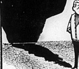
The Shelby News

For years I suffered in silence, I thought only cranks and cranky types could do that. I read the news and the newspapers, I heard how Washington, but it's a back lot, and the Court House, and City Hall. A friend of mine has discovered a cure. At least it gives him a feeling of relief from that helplessness that grips so many of us. Our friend (sometimes we wonder about his friendliness, but he is generally a nice guy) stops us and comments on editorial, news, how we like the paper, and other papers. We listen to his paper, and other papers. We take to elected officials, funds, funds, comments, suggestions, criticisms. Now and then he can be a damn nuisance. Recently, after he had pointed out our fur the right way and left us feeling friendly toward him for the moment, we asked why he makes a habit of showing concern over public affairs and other people's business. Our cranky friend and severe critic didn't put it in these words, but here's our impression of his reply: