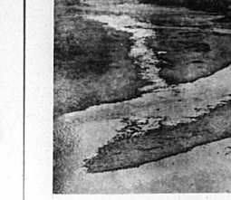
IT MAY BE LOWER NOW--This is Licking River, the rifle below the old saw mill at Parks Hill, as it appeared several weeks ago. It doesn't look like much water is there, but at least it keeps on flowing, and Carlisle's pipe-line keeps the city well supplied with water.