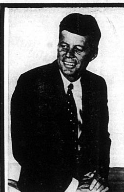
PRESIDENT JOHN FITZGERALD KENNEDY 1917 - 1963

President John F. Kennedy, thirty-fifth president of the United States, was assassinated Friday, November 22, in Dallas, Texas. Kennedy, 46, was shot to death as he rode with his wife, Mrs. Jacqueline Kennedy, in an open limousine as they were leaving downtown Dallas, to the Dallas Trade Mart, where he was to speak.