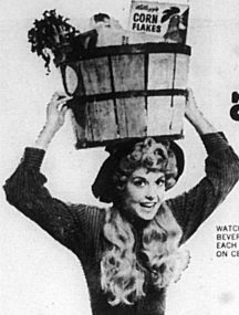
WATCH "THE BEVERLY HILLSBILLIES" EACH WEEK ON CBS-TV