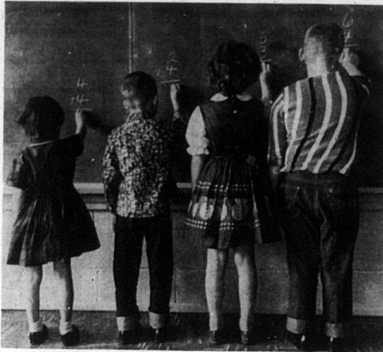
THE PHYSICAL DIFFERENCES of children in the ungraded primary unit are obvious in this group at the McKinney School in Lincoln County. There is an attempt to group children of the same intellectual and social development together for classwork, even though their physical stature and chronological ages may vary.