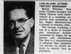
DONALD DAVIE Donald Davie, distinguished English poet from Cambridge University, will serve as George Eliation poetry lecturer for 1963 at the University of Cincinnati.