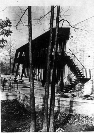
LAKESIDE VIEW (left) of the main building shows the large patio adjoining the dining room and a second-level balcony adjoining the lobby and lounge at Rough River Dam State Park. Exterior of the building, in native stone and cedar, blends with the wooded setting.

plenty of hot water for all from your flameless, fast-response electric water heater