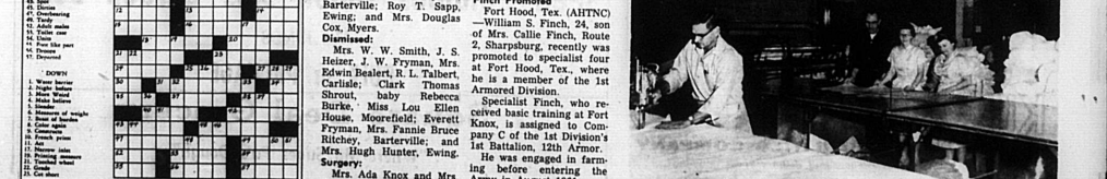
THE CARLISLE (KY.) MERCURY Thursday, April 4, 1963 PAGE 3