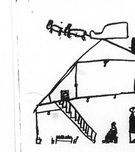
DRAWN BY REX CASKEY Compliments of