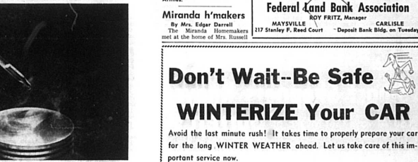
Ordinary oils can create dry, overheating oil. Also, you see what happens when a conventional motor oil is dripped on the cylinder head above the piston device. These ordinary oils cause carbon to build up on your engine's hot spots.