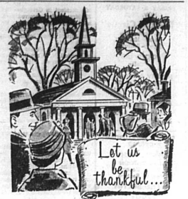
Let us be thankful...

only appeared to gather the to remark whether in the state, maintain for the UK library. A volume of Bates City, Okla., and all family letters and bank books started his work last year. More papers are very important. (Continued on page 7)