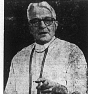
DOCTORS' BILLS The American Republic Medical and Surgical Plan helps pay doctors' bills for sickness or accident.

see this important film. The representative who calls on you will arrange a time that is convenient to you.