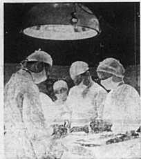
SURGEONS' BILLS American Republic Hospital, Surgical and Nursing Plans and the American Republic Medical and Surgical Plan help pay expensive surgeons' bills for operations.