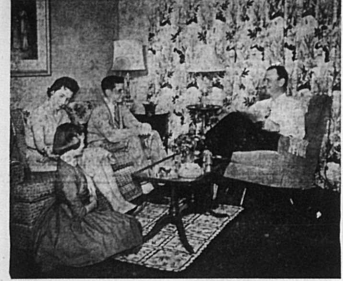
YOUR FAMILY DESERVES American Republic Tailored Protection

All residents of Carlisle and Nicholas county who qualify will have the opportunity to have the American Republic Plans of Protection. These famous Plans now help protect many thousands of individuals and families against expensive hospital, surgical, nursing and doctor bills for either sickness or accident. The program to explain this protection to all residents of the county is now beginning and it will continue until all residents of the county have been contacted and the American Republic Plans of Protection explained to them.