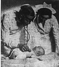
CHILDBIRTH American Republic Hospital, Surgical and Nursing Plans and the American Republic Medical and Surgical Plan help pay hospital and doctor bills for childbirth.

American Republic TAILORED Protection Plan for HOSPITAL SURGICAL MEDICAL NURSING fully explained