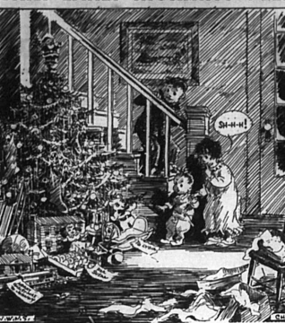
100 YEARS AGO