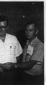
500 KICK-OFF 4-H COUNCIL DRIVE—to raise funds for a 444 camp site, which it is hoped will be located in Nicholas County

DEED RECORDED Fred Butler and wife, 90 acres to Robinson road.