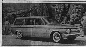
Corvair station wagon models the reputation for styling, reliability and economy. Chevrolet added a sports wagon and station wagon. The car with its air-cooled engine.