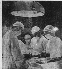
SURGEONS' BILL American Republic Hospital, Surgical and Nursing Plans and the American Republic Medical and Surgical Plan help pay expensive surgeons' bills for operations.

Just a few minutes of your time is needed for a private showing in your home for you and your family to see, "The Tom Davis Family." The representative who calls on you will arrange a time that is convenient for you.