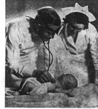
CHILD BIRTH American Republic Hospital, Surgical and Nursing Plans and the American Republic Medical and Surgical Plan help pay hospital and doctor bills for childbirth.