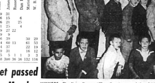
Wrong column... Unofficial results of the election in Nicholas County, Ky. will be announced...

CARLISLE, KY., THURSDAY, NOVEMBER 6, 1958 PRICE TEN CENTS NUMBER 45