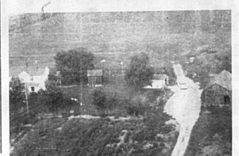
Whose Farm Is Pictured Here??

Free Gift Certificate—Aerial Photo To Farm Owner