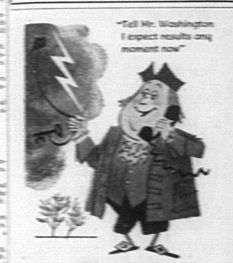
Long Distance puts you in touch, faster Call by Number—It's Twice as Fast SOUTHERN BELL TELEPHONE AND TELEGRAPH COMPANY