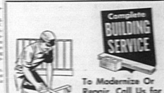
To Modernize Or Repair, Call Us for BETTER WORK! For alterations, modernization or new building work—price cuts—call us for our long experience and fair prices it is the job for you efficiently and satisfactorily. "Always Glad To See You; Always Glad To Serve You" RATLIFF BROTHERS Phone 10 No Obligation