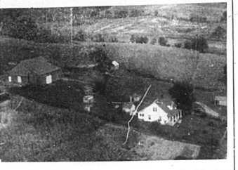
Whose Farm is Pictured Here? ?

Free $3 Gift Certificate • Aerial Photo To Farm Owner MAIL Your Entry by SATURDAY Phone or Personal Calls Not Eligible