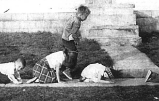
Methodist meet at Flemings

Largest Circulation: The Mercury therefore is the advertising Medium