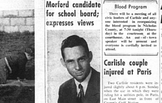
Methodist meet at Flemings

Methodist candidate for school board; expresses views