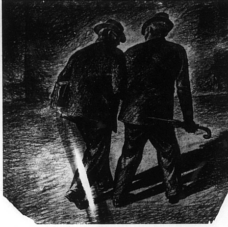
"So stupid--those Americans"