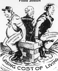
ROBBING COST OF LIVING