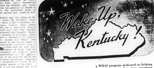
a WHIAS program dedicated to helping Kentucky regain her true greatness