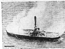
This picture, taken from an airplane, shows the burning freight steamer...