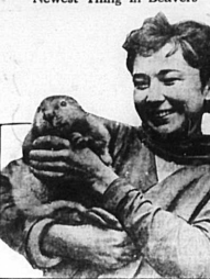
The beaver pup got at North Carolina, arrives here and stays with the boy who got it. He is not just a pet, but knows the will of his owner and will even be for him whenever. The beaver pup cost three months in being shipped.