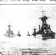
The U. S. Navy battleship USS Tennessee, under way from Norfolk to her port of destination, the West Indies in the Caribbean Sea.