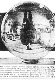
The world's largest decorative crystal sphere, measuring 10 1/2 feet in diameter and weighing 10 1/2 tons, has been presented to the United States National Academy of Sciences. The sphere shows the striking result of the photographer's attempt to increase a picture of the sun above a regular magnifying glass. The sphere is made of pure glass and is the result of a process which has been tried by the U. S. Navy.