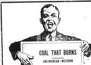
Illustration of a man in a suit, part of the Coal That Burns advertisement.