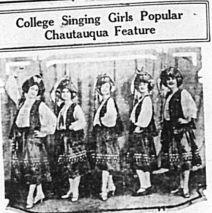
College Singing Girls Popular Chautauqua Feature

THE CARLISLE MERCURY... Published weekly by the Carlisle Coal & Feed Co.