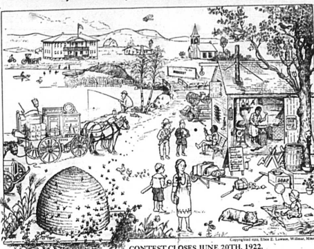
CONTEST CLOSES JUNE 20TH, 1922.

Find the objects in this picture Beginning with the Letter "B"