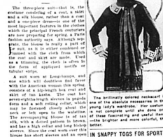
Man in Making Three-Piece Suit...

Cost, Shirt and Bowtie Costume, Fresh Spring Utility.