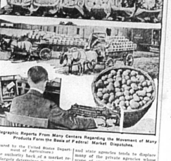
Telegraphic Reports From Many Countries Reporting the Movement of Many Products From the Office of Federal Market Reporting.