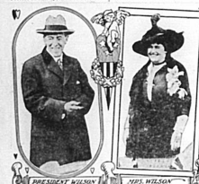
MR. WILSON AND MISS GALT