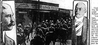
Washington authorities report that certain United States troops are being withdrawn from Mexico...