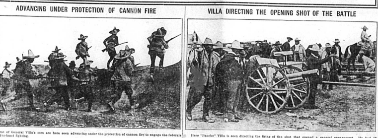
Here "Ranch" Villa is seen directing the firing of the shot that opened a general engagement...