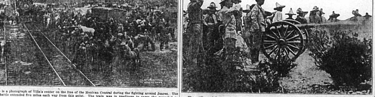
This is a photograph of Villa's center on the line of the Mexican Central during the fighting around Juarez...