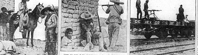
These are some of the sharpshooters used as efficiently by General Aguilar in the important district of Tuxpan.