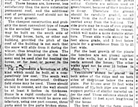
Fig 1—Lawn Greenhouse

The lawn greenhouse is a structure that is used for growing plants. It is a structure that is used for growing plants. It is a structure that is used for growing plants.