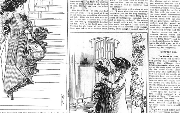
All that Her Husband Will Still Bestowing When at Last We Meet Him

Lucia felt a sudden impulse to tell them everything, but she knew that would only lead to more heartache. She forced herself to remain silent and to look down at the ground. "I am perfectly well, father," Lucia replied, her voice steady despite the turmoil within her. "Why do you look so ill?" her mother asked, her hands clasped in prayer. Lucia looked at her mother and saw the love and sympathy in her eyes. She knew that her mother would be on her side, but she also knew that her father's opposition was a formidable barrier. She felt a sudden impulse to tell them everything, but she knew that would only lead to more heartache. She forced herself to remain silent and to look down at the ground.