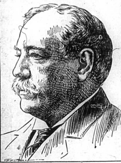
T. H. PAYNTER, United States Senator from Kentucky.