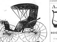
MYALL & SHACKLEFORD

Notice to horsemen regarding horse clipping services.