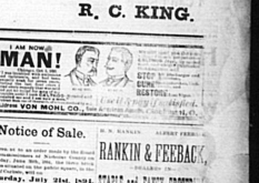
R. C. KING'S WATCHES